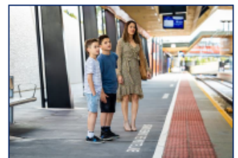
Stay Switched On – remember to always stand behind the white lines when waiting at a station.

Project Information Phone: 1300 080 834 Email: dlt.gawler@electrification@sa.gov.au Website: www.dlt.sa.gov.au/gawler