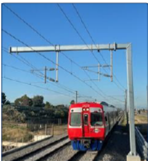
The first diesel test train approaching Mawson Lakes Railway Station on Friday, 26 February 2022.

In March and April 2022, the number of test trains will increase with high-speed electric trains and diesel trains regularly operating on the Gawler rail line to complete the final stages of testing and commissioning.